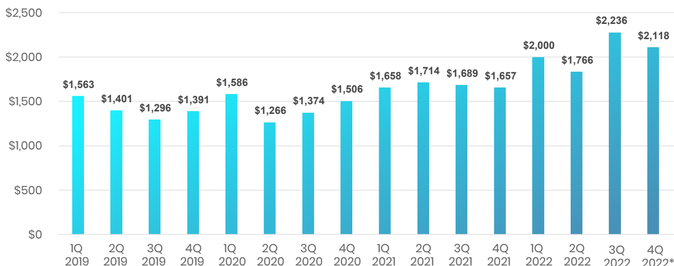
AVERAGE UNIT PRICE $PSF ON LAND AREA FOR GCB TRANSACTIONS BY QUARTER