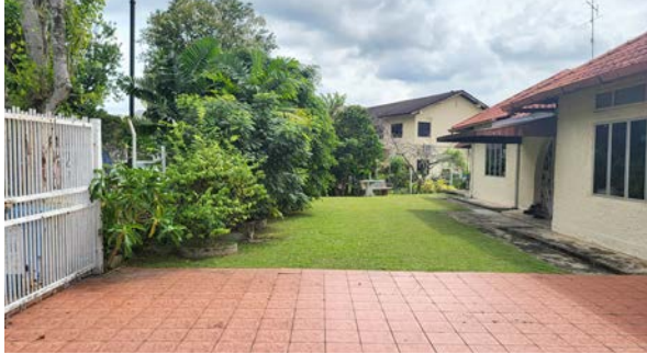
Land along Clifton Vale Single-storey Detached House in Braddell View Estate