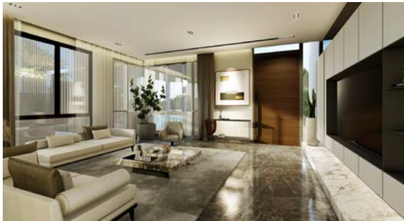
2.5-storey Detached House along University Road