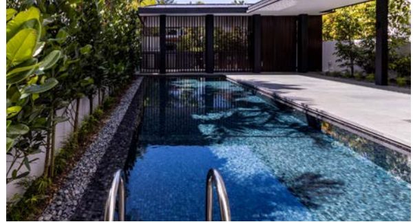
3.5-storey Detached House in Astrid Hill area