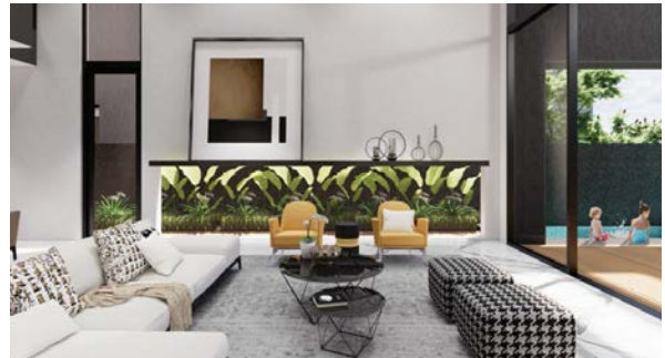
2.5-storey Detached House along Harlyn Road area